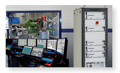
Integration example in motors gas analysis bay